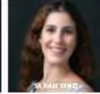
SA DAI ENO