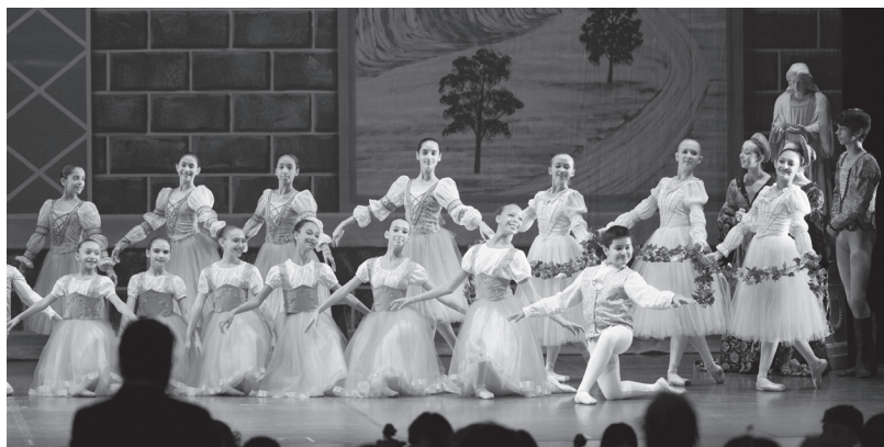
The School of Ballet Arizona students in Raymonda.

Raymonda and Jean de Brienne are finally married and a celebration begins. Everyone at court dresses in Hungarian fashion and performs a range of dances.