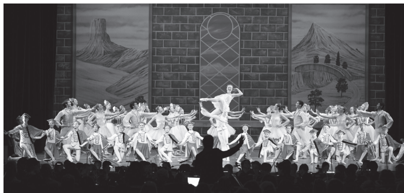
The School of Ballet Arizona students in Raymonda.