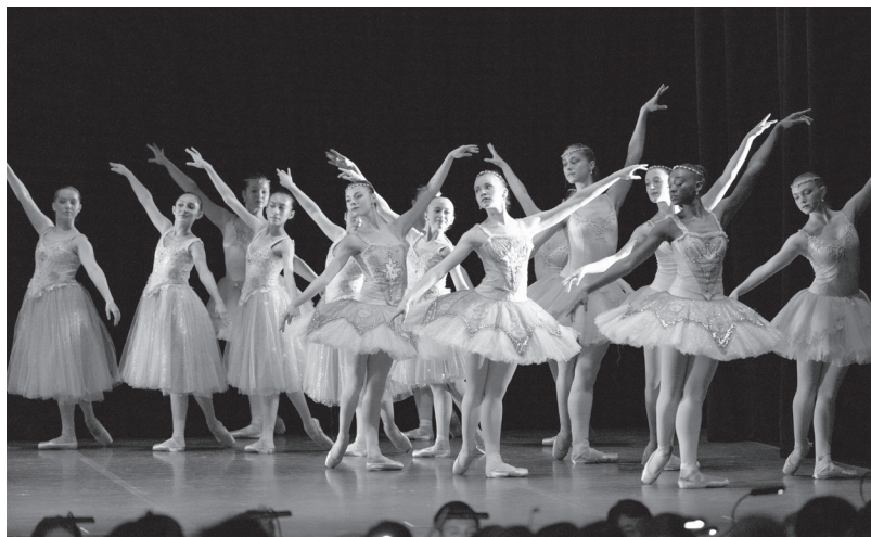
The School of Ballet Arizona students in Raymonda.

The Studio Company performs alongside the professional company and presents its own works independently. The Studio Company is a bridge between school and professional life, providing an opportunity for students of the highest rank that possess the potential and desire to pursue a career in dance. An indispensable and important part of their training is understudying and appearing regularly on stage with Ballet Arizona and in Studio Company productions. Studio Company members are selected by audition only and hail from all over the world.