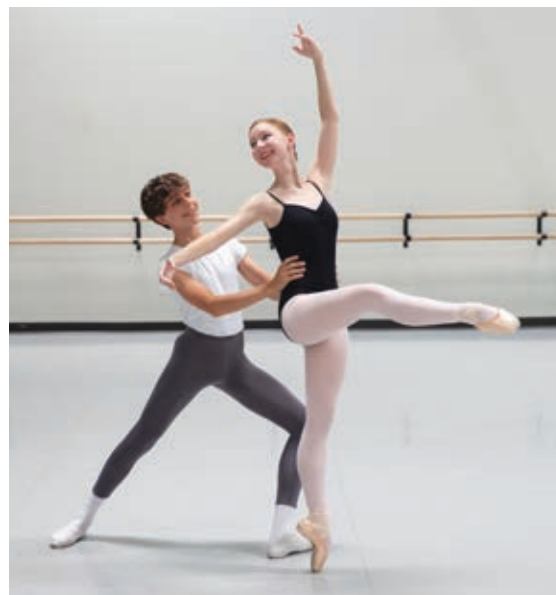
SBAZ students.

studies at SBAZ, progress into the Studio Company, and ultimately join Ballet Arizona as a company dancer.